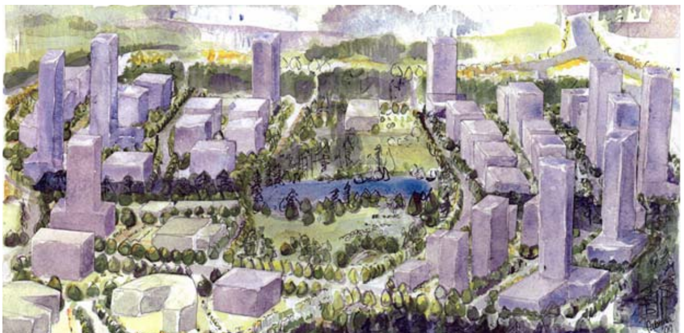
Concept sketch for AmberGlen area looking south from Cornell Road, near The Streets of Tanasbourne. Artist: Sabrina Henkhaus, 2009