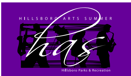
Hillsboro Arts Summer Camp July 9 - 20, 2012