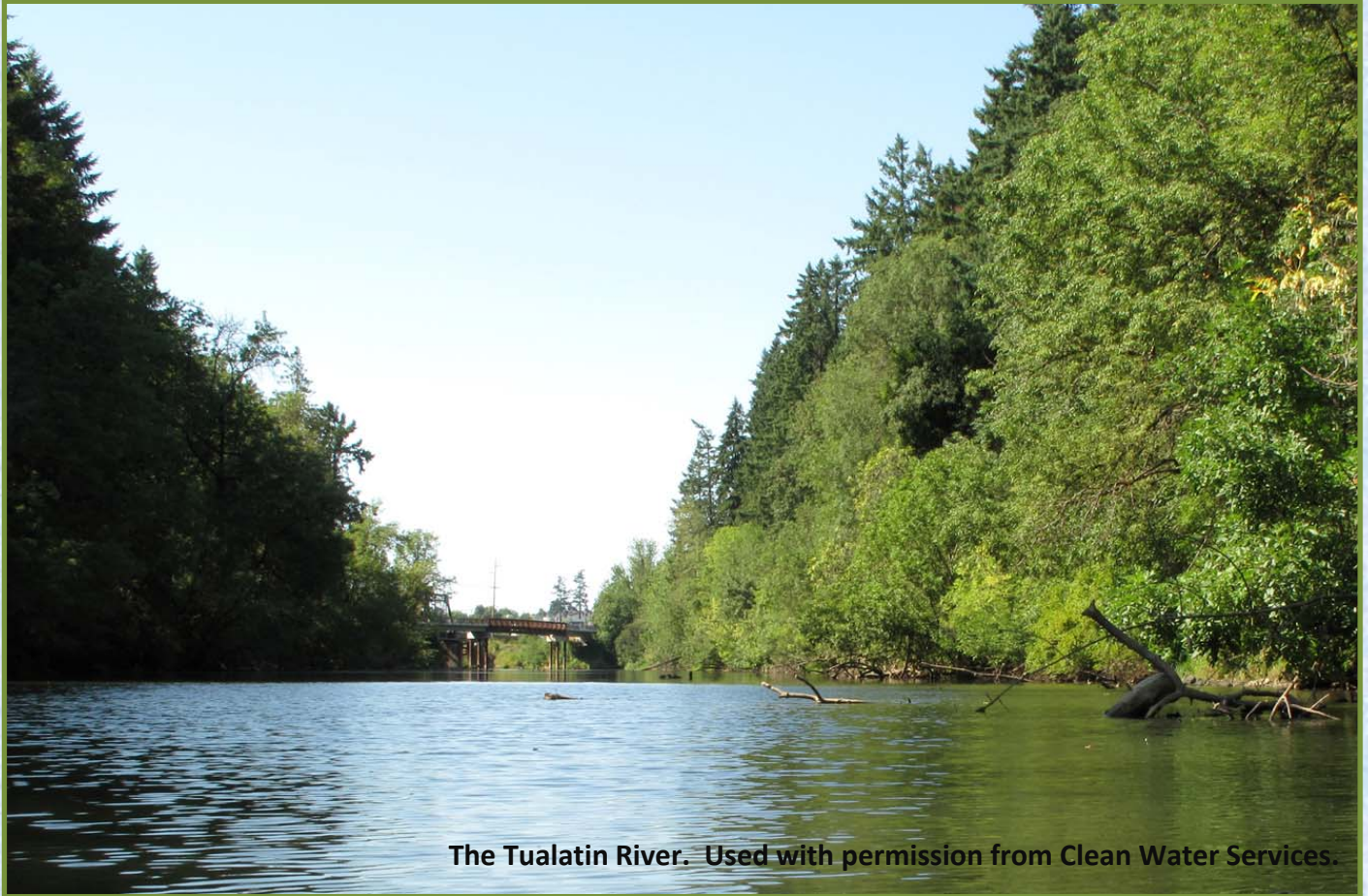
The Tualatin River.

Hillsboro ♦ Forest Grove ♦ Beaverton ♦ Tualatin Valley Water District